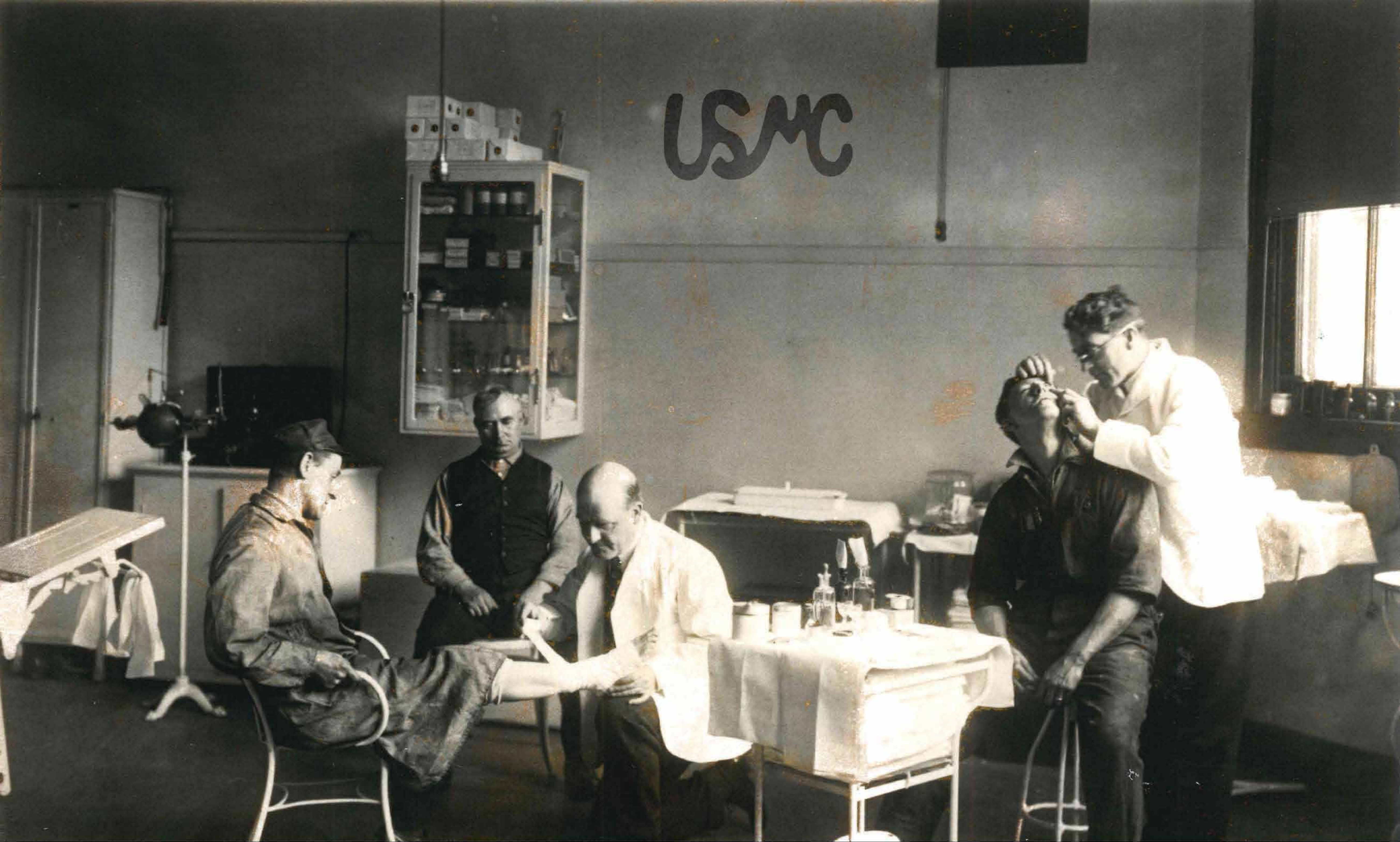
The United Shoe “Hospital” treated injured employees on site, near the center point of 100 Cummings Center on the second floor.