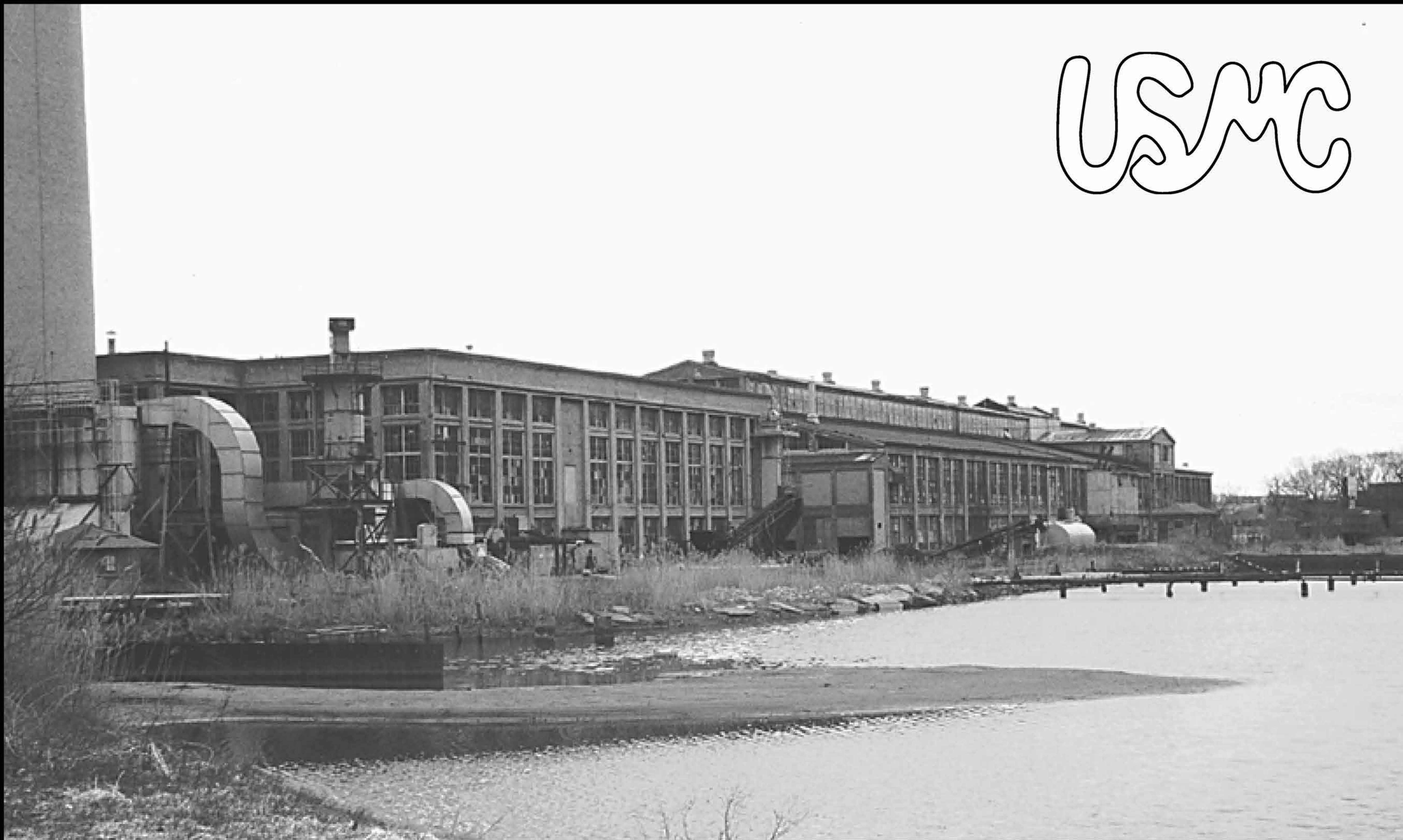
800 Cummings Center from the northwest. The original boiler house and chimney are in the foreground and the former foundry is to the right.