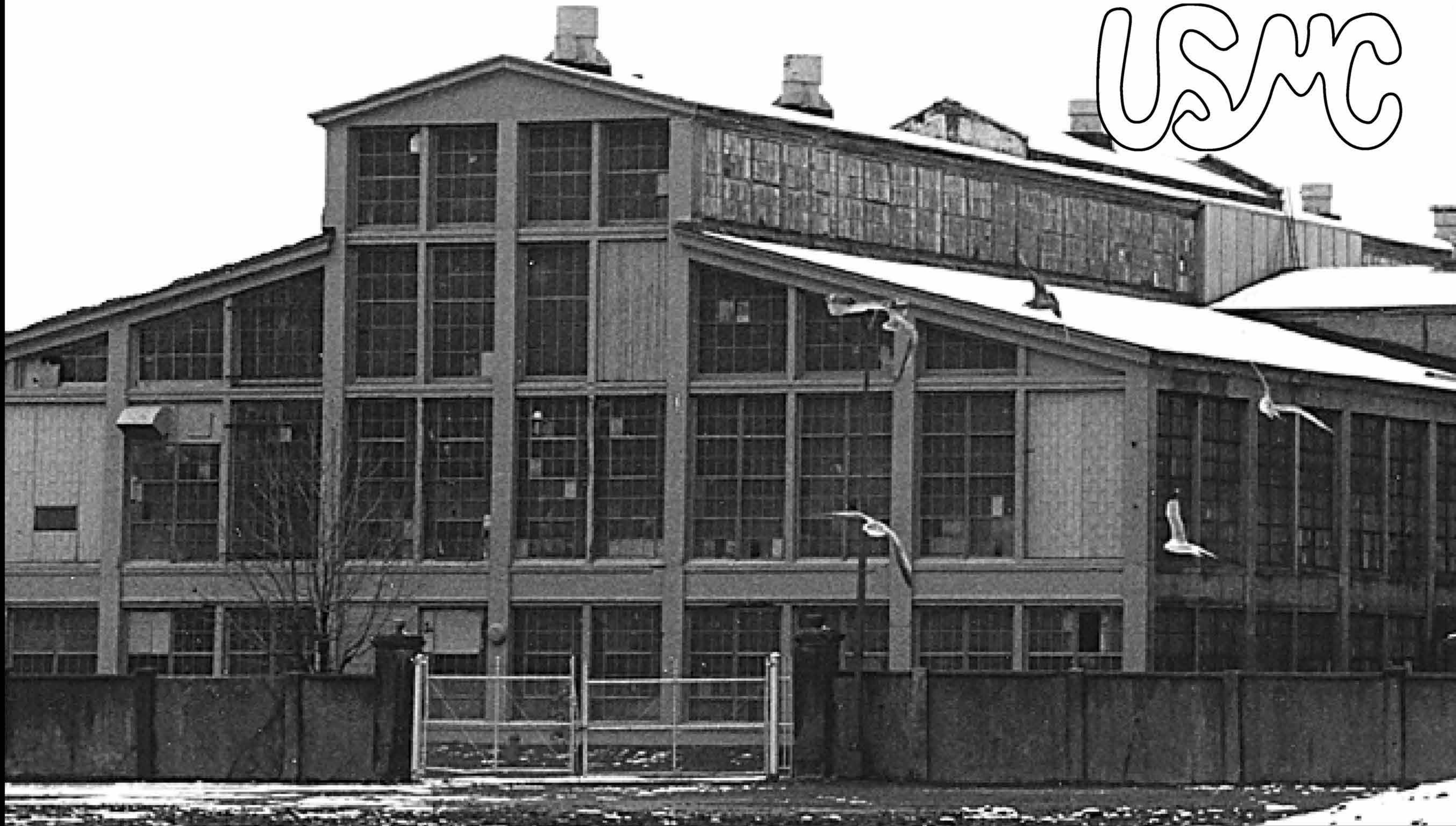
The former foundry building is shown here in January 1996 in this photo taken from Elliott Street, looking toward the northwest.