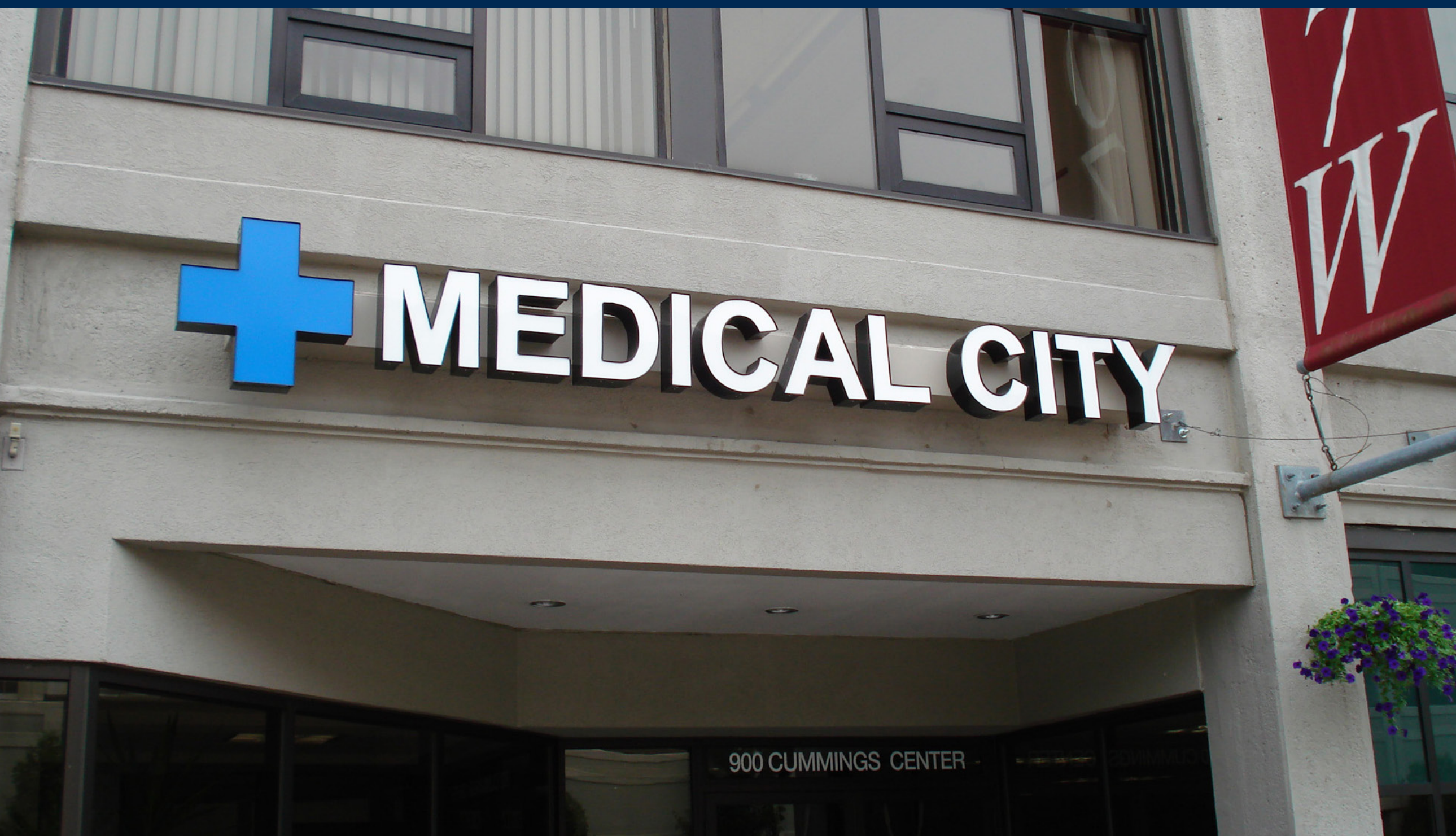
NUMEROUS MEDICAL PROVIDERS