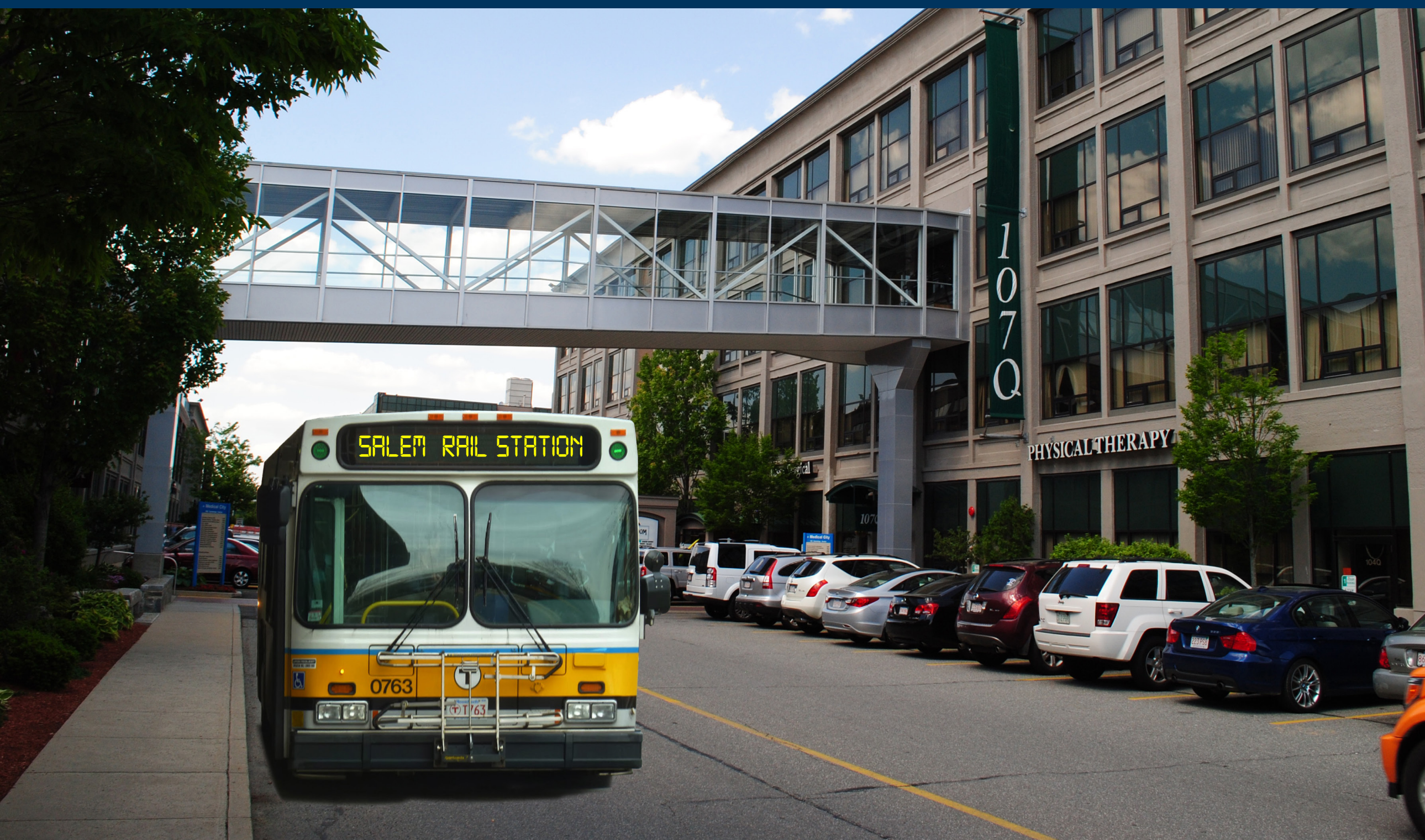
MBTA AND CATA BUS SERVICE