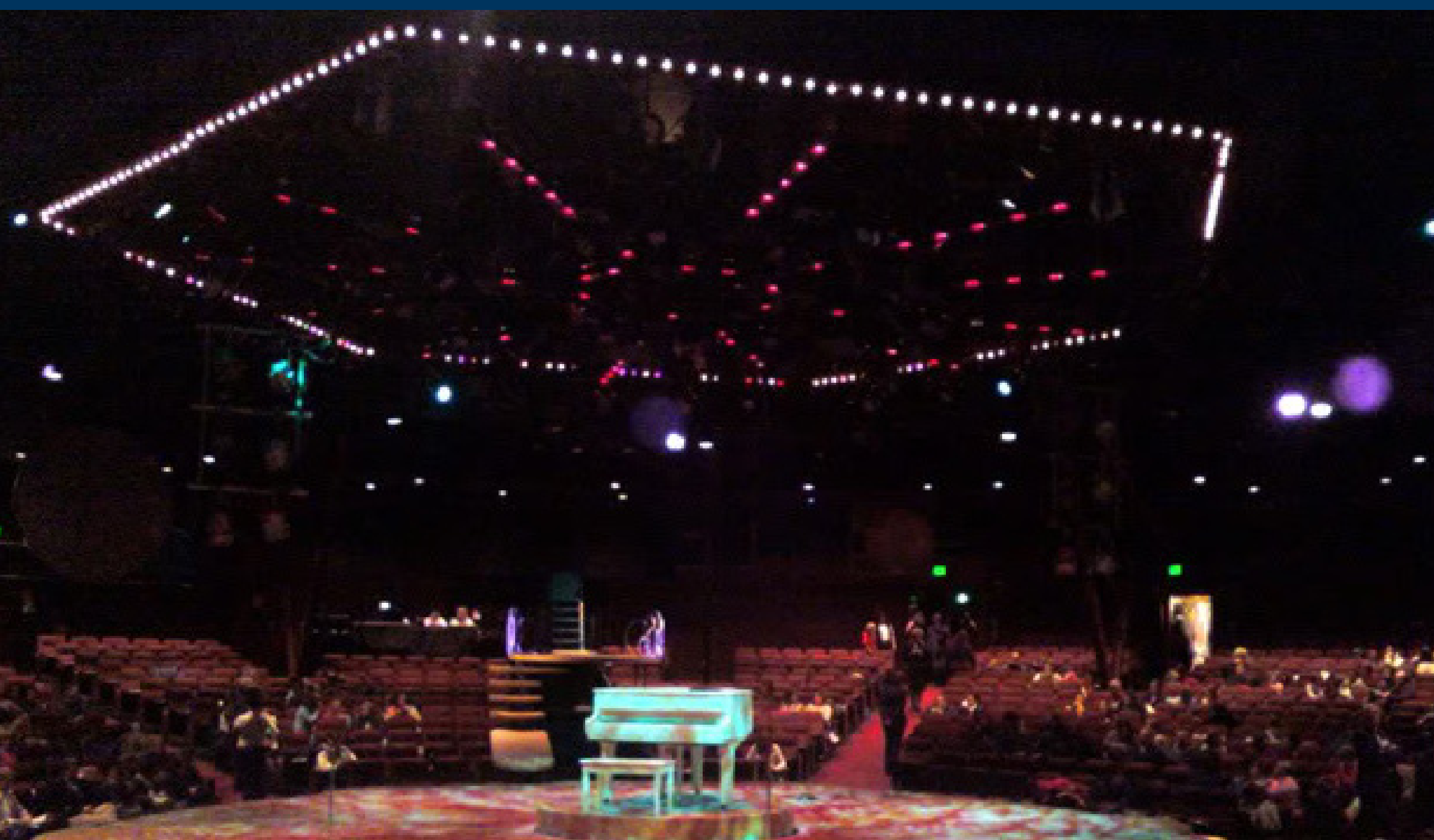
NORTHSHORE MUSIC THEATER