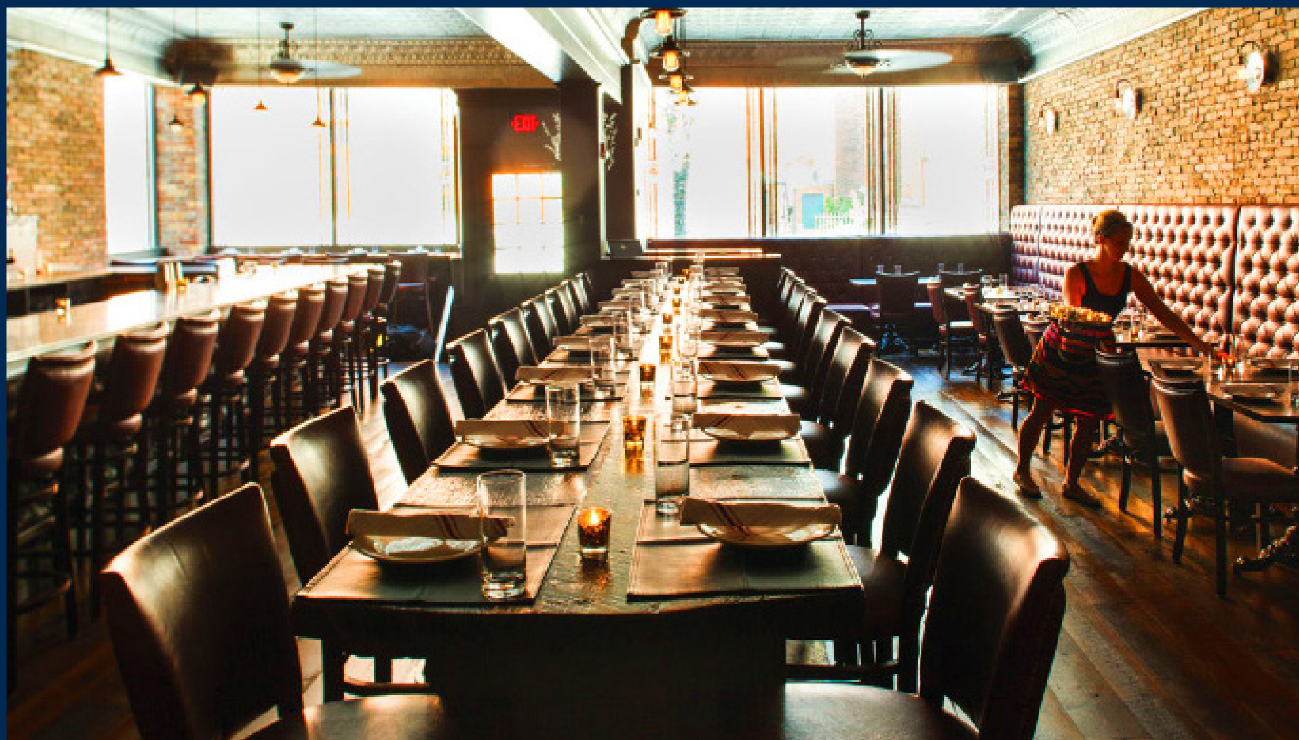
AMERICAN BARREL HOUSE