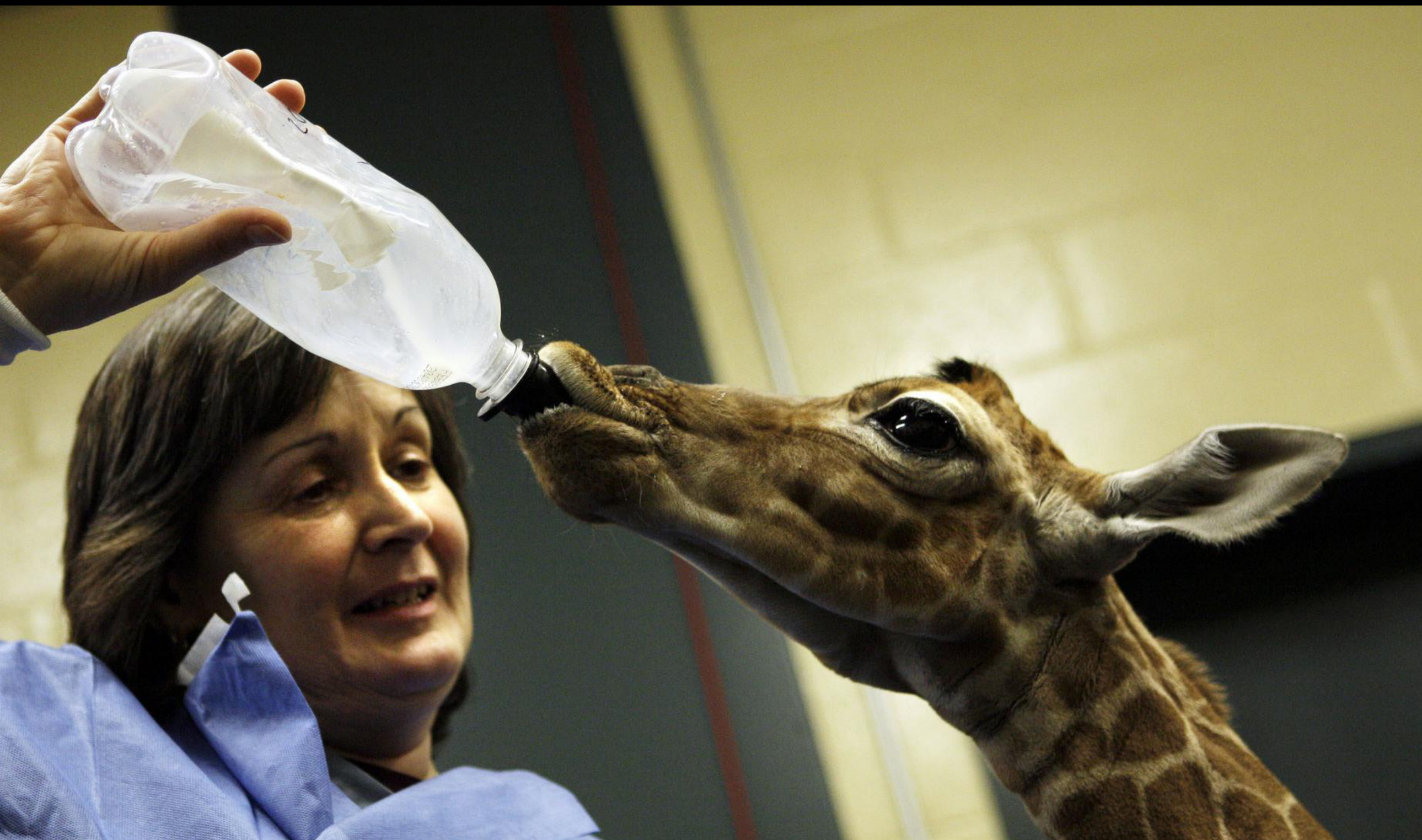
Tufts/Cumming's School of Veterinary Medicine