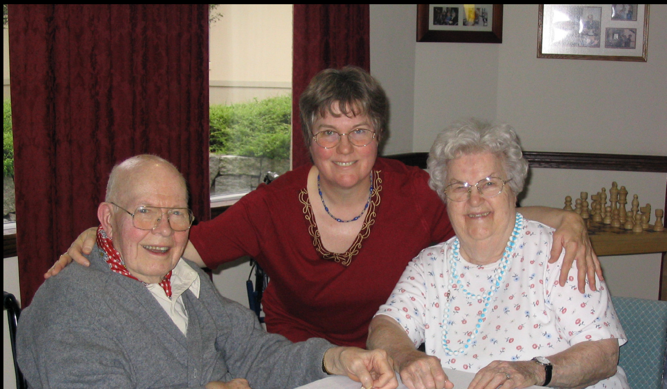
New Horizons Retirement Communities