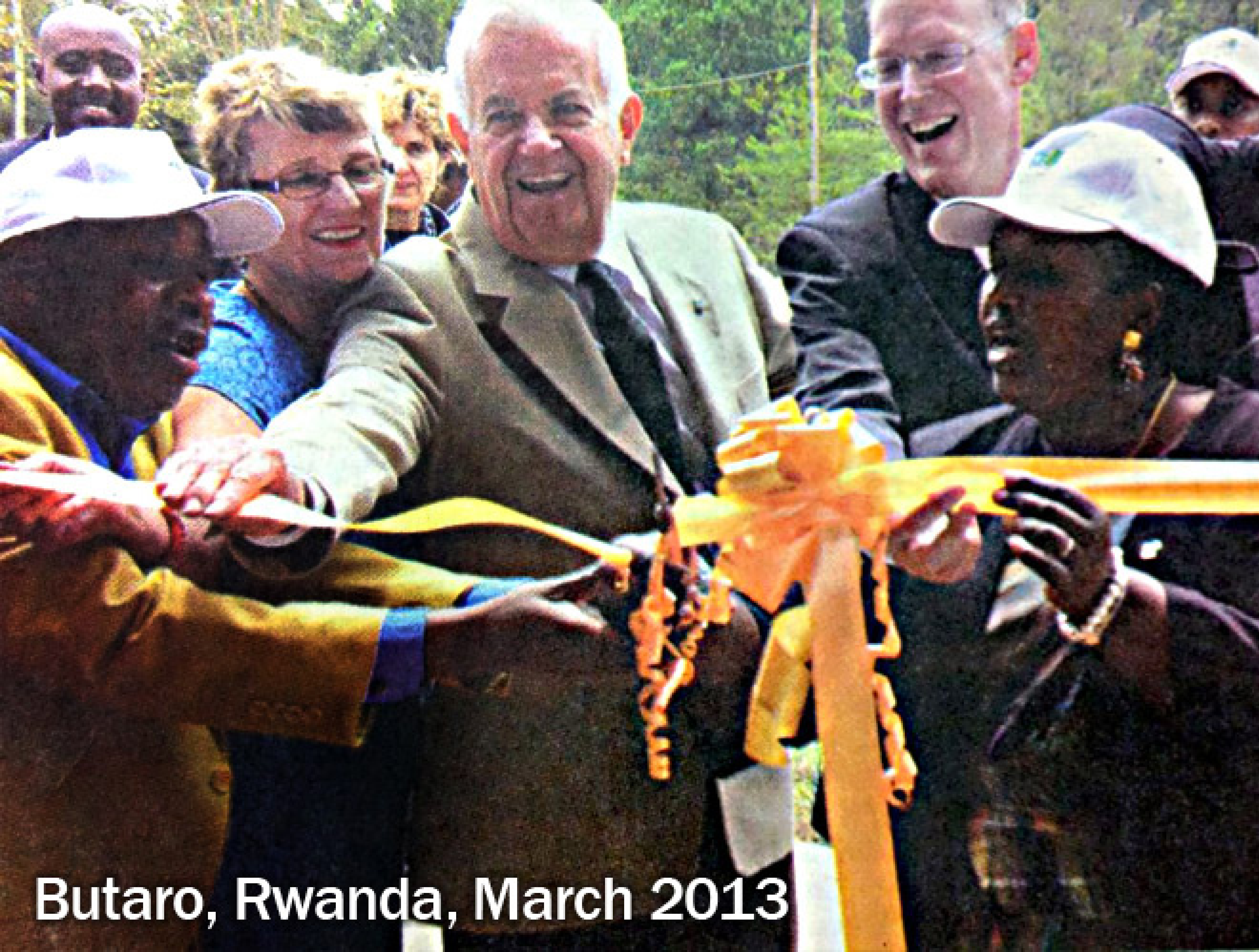
Butaro, Rwanda, March 2013