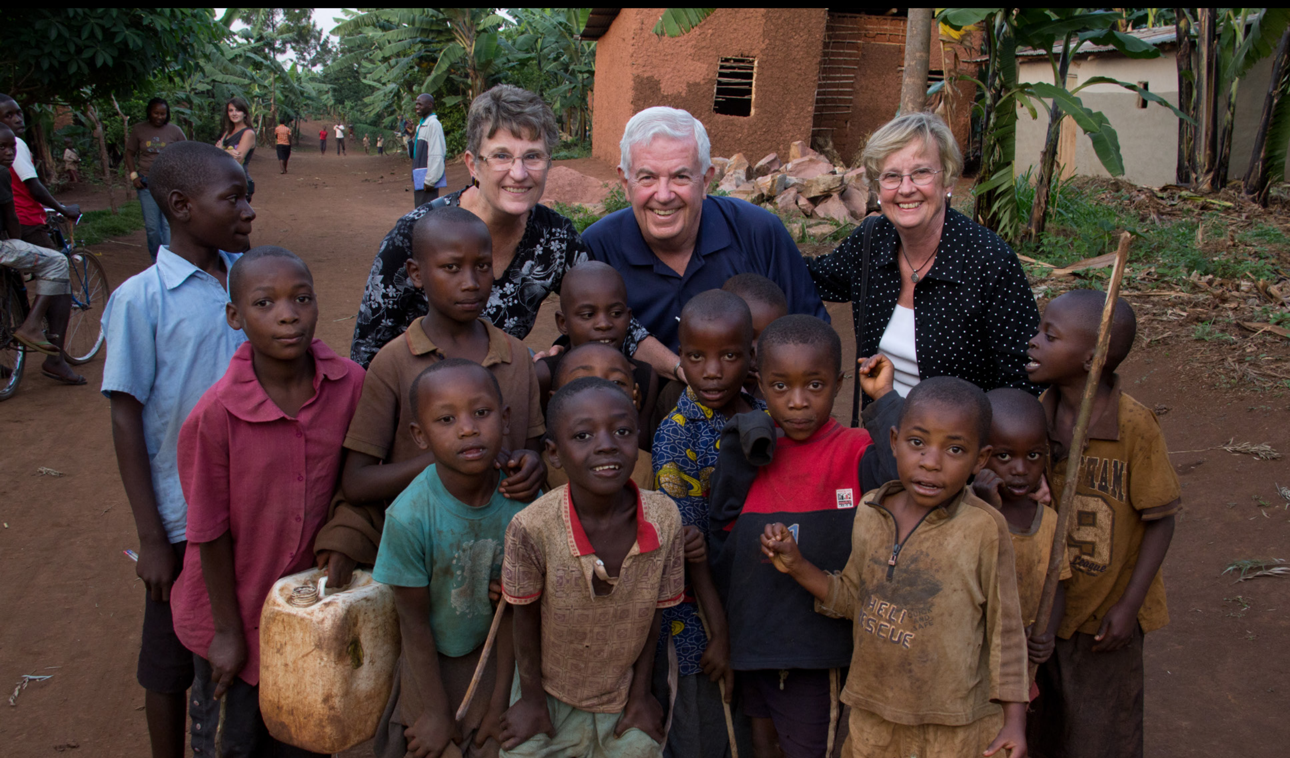
Institute for World Justice