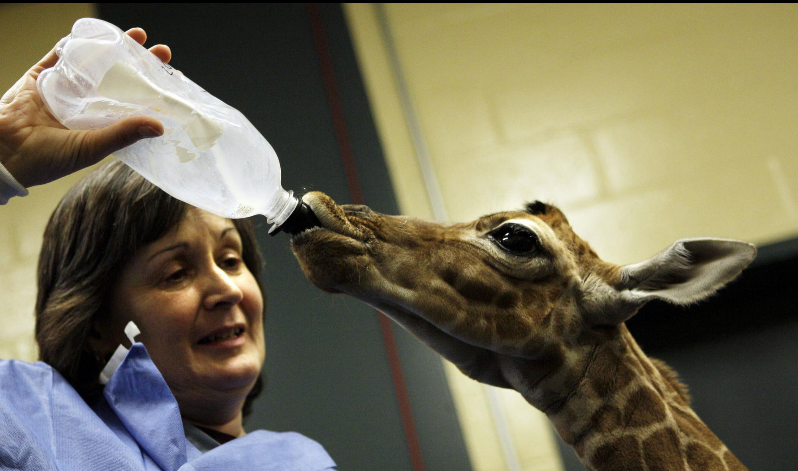
Tufts/Cummings School of Veterinary Medicine