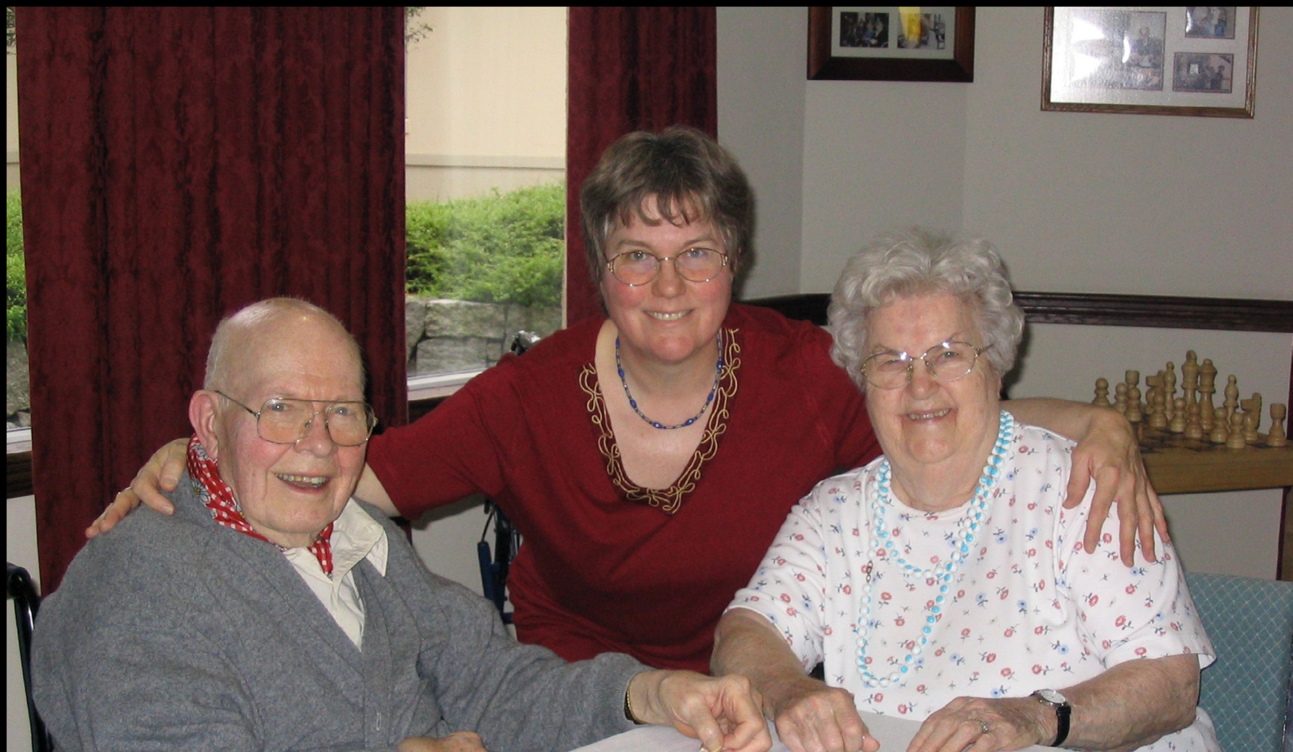
New Horizons Retirement Communities