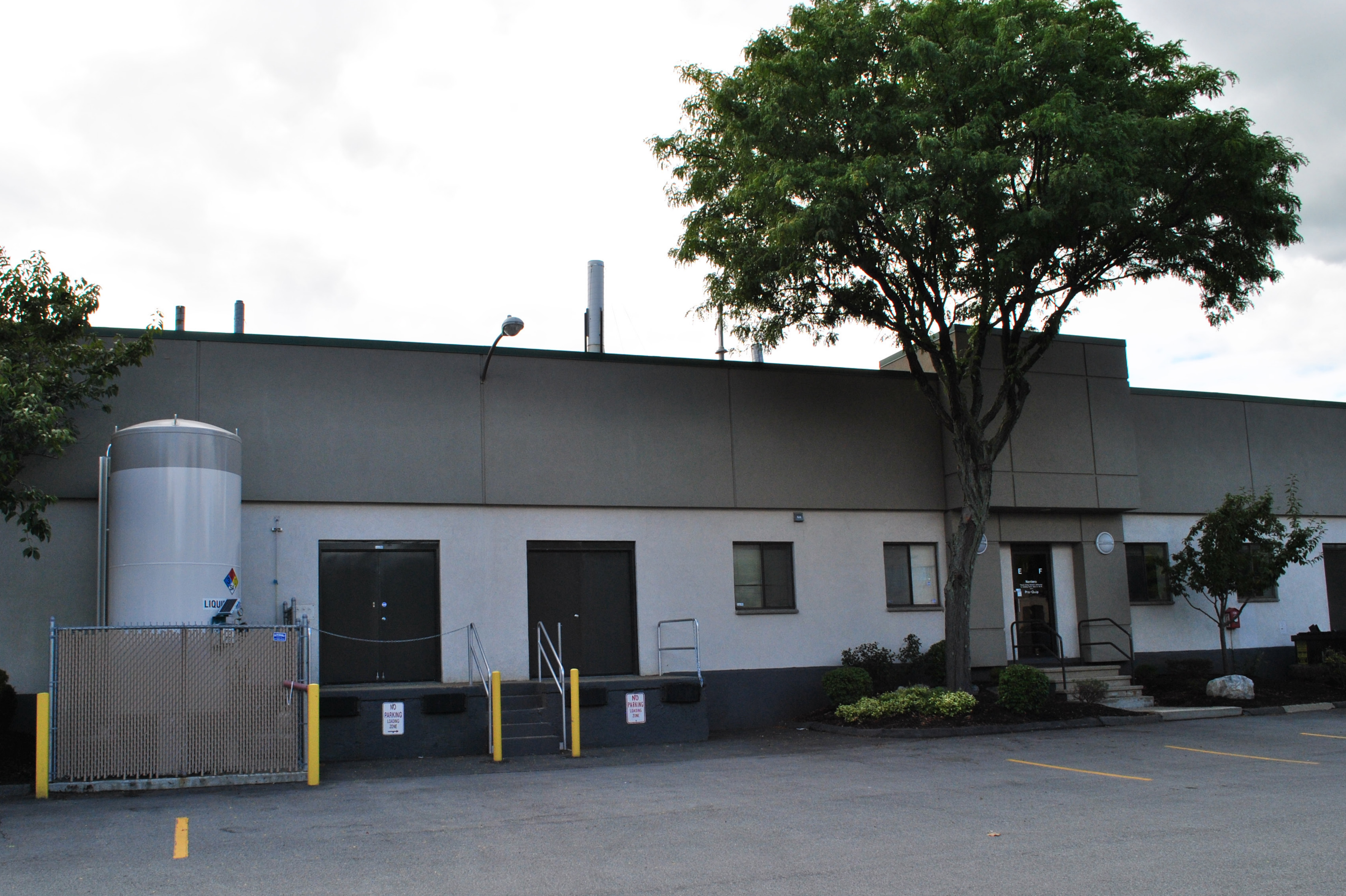
25 Olympia Ave, Woburn