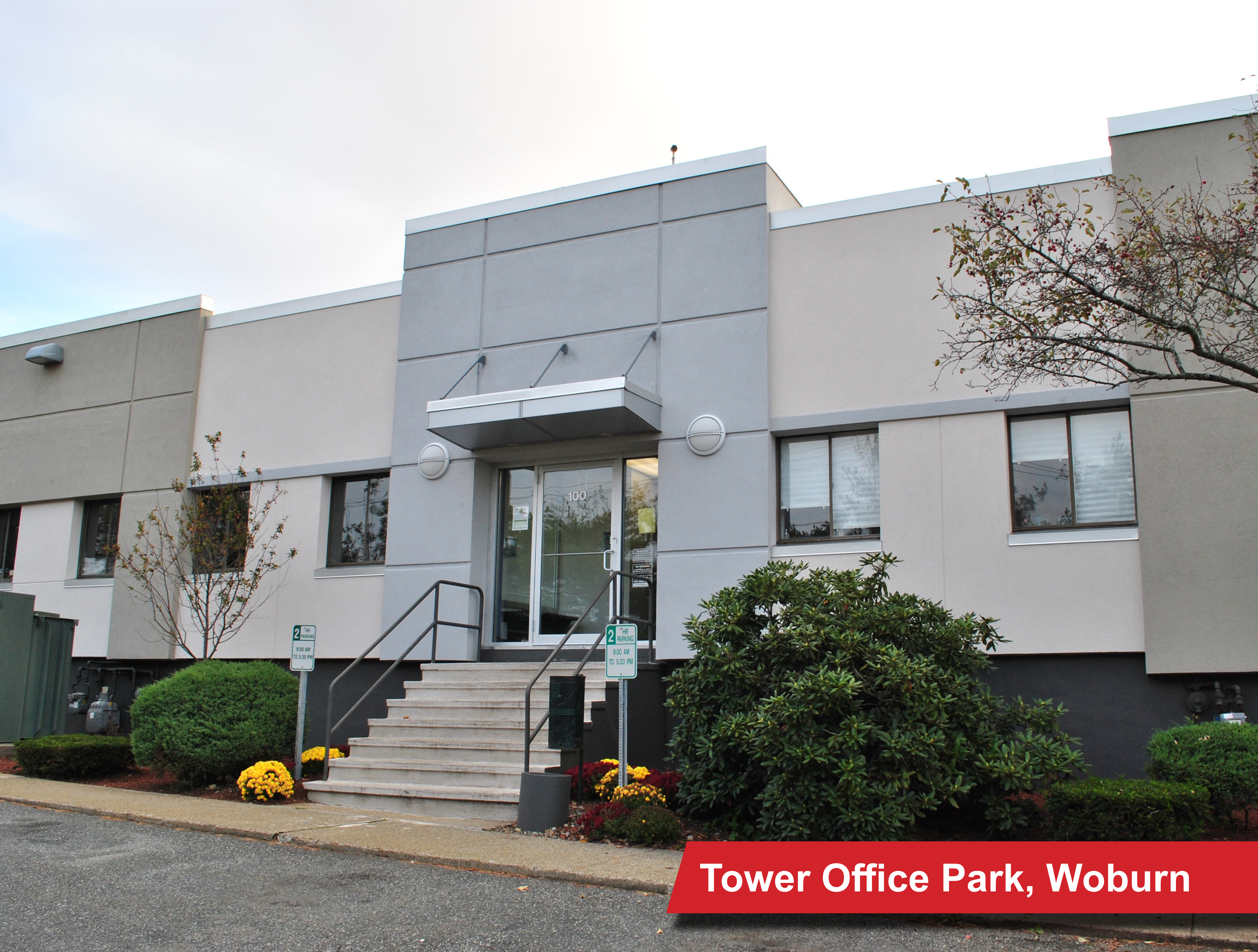
Tower Office Park, Woburn