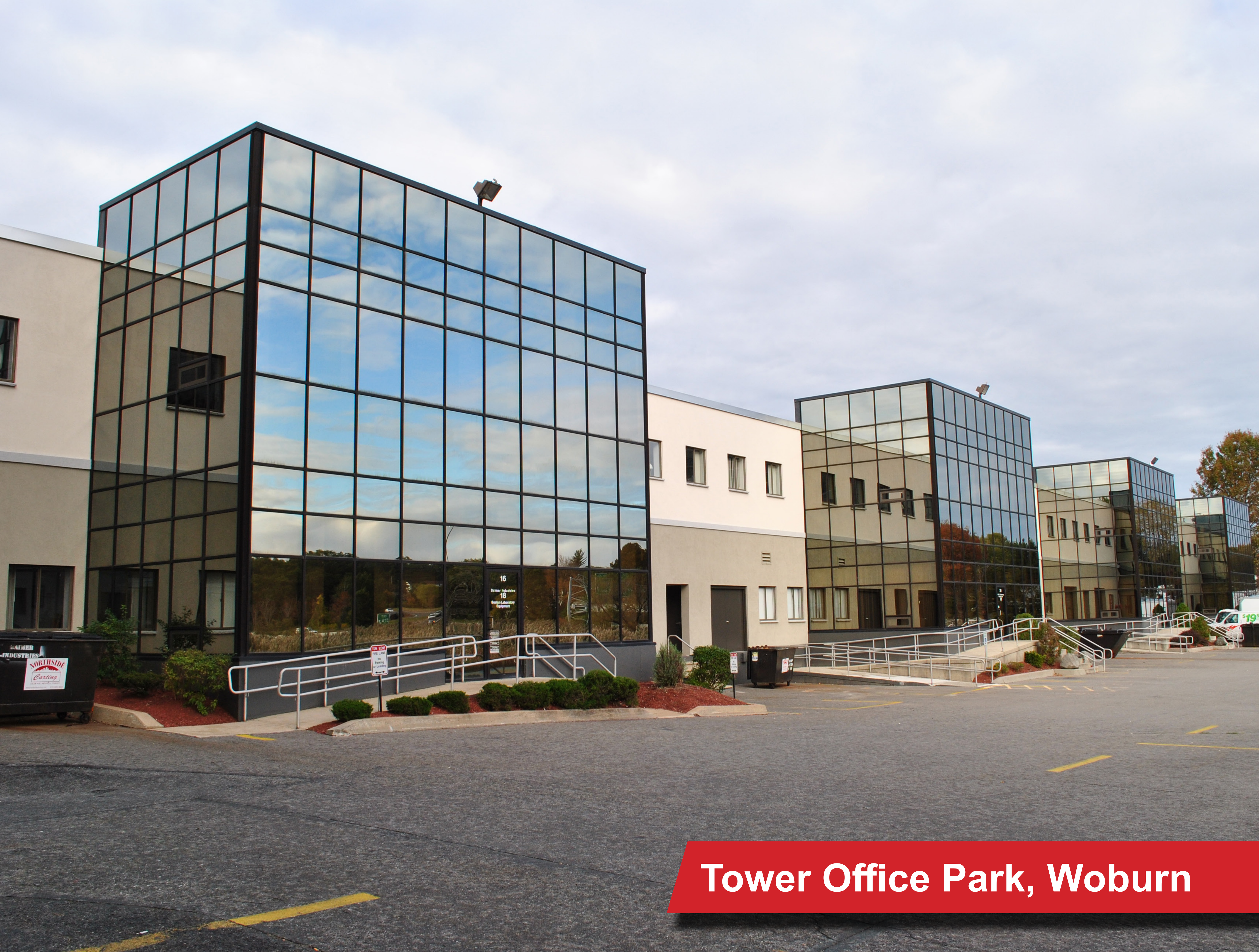
Tower Office Park, Woburn