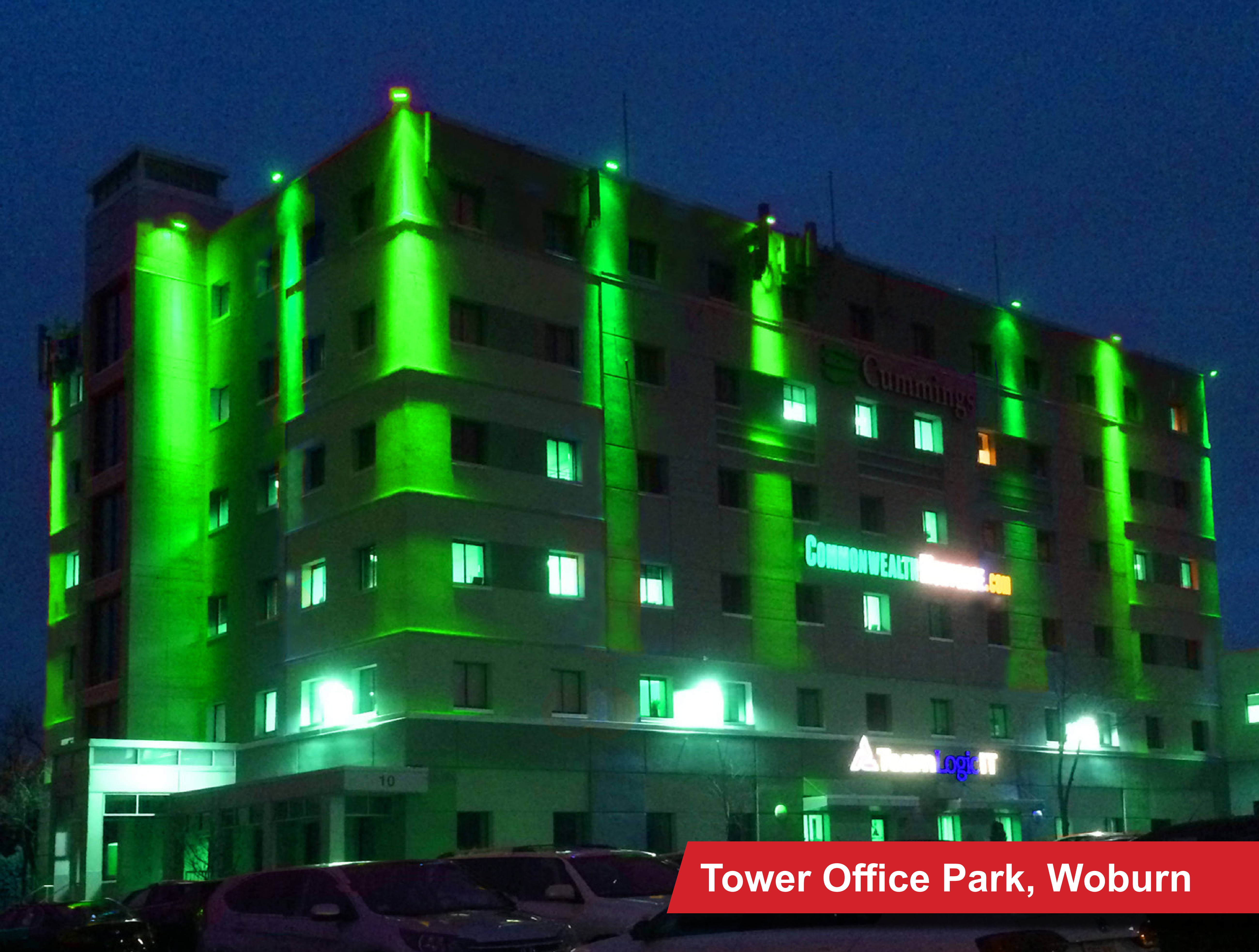
Tower Office Park, Woburn