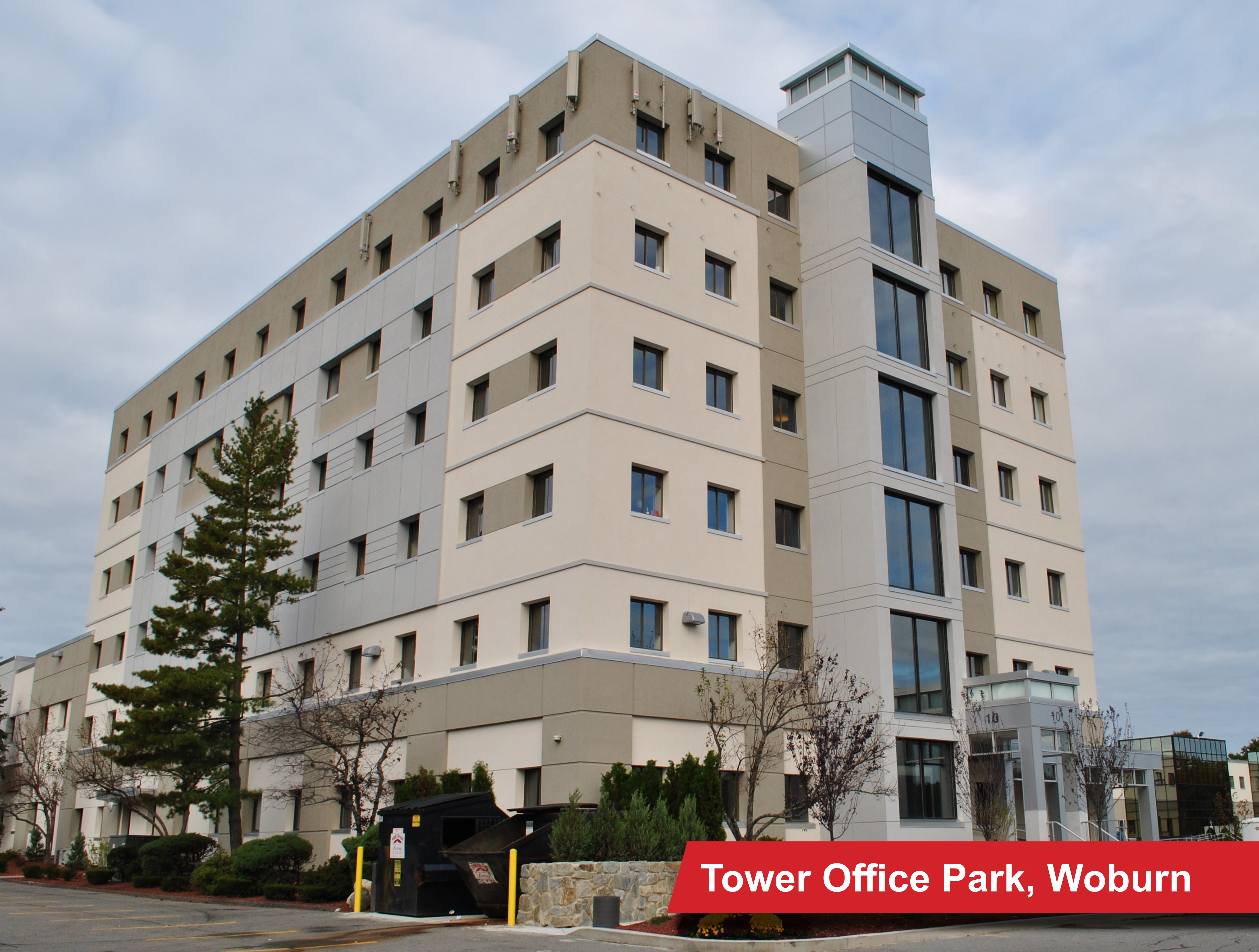
Tower Office Park, Woburn